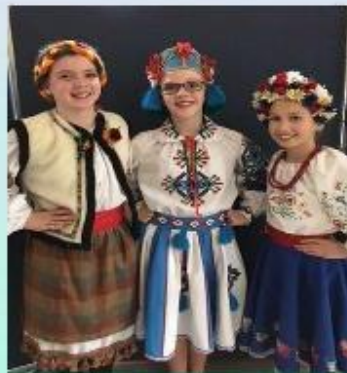
Members of Arborg Reechka Ukrainian Dance Club